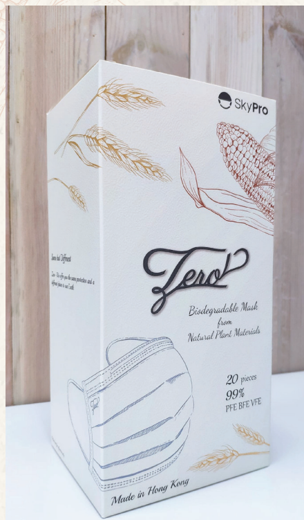
Outer Box Image